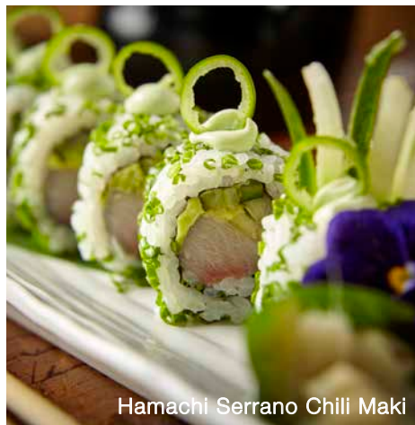
Hamachi Serrano Chili Maki