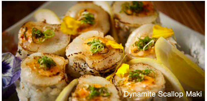
Dynamite Scallop Maki