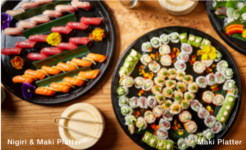
Nigiri & Maki Platter