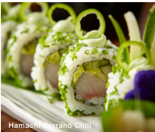
Hamachi Serrano Chili