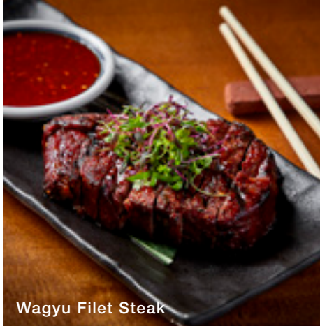
Wagyu Filet Steak