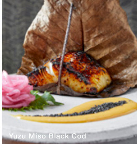
Yuzu Miso Black Cod