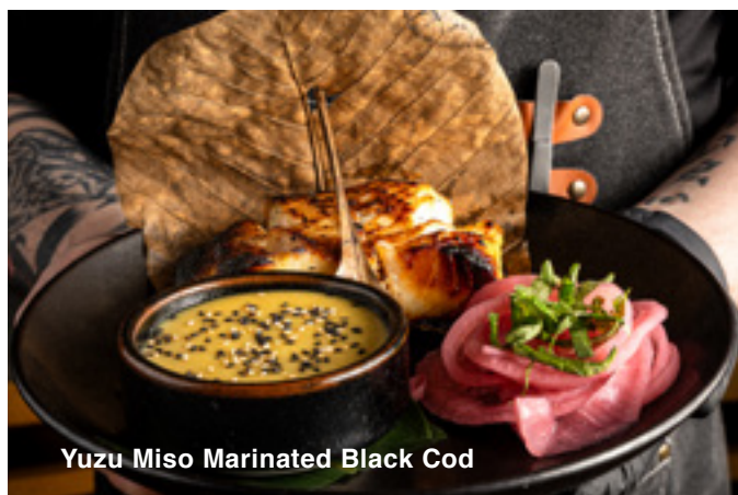
Yuzu Miso Marinated Black Cod