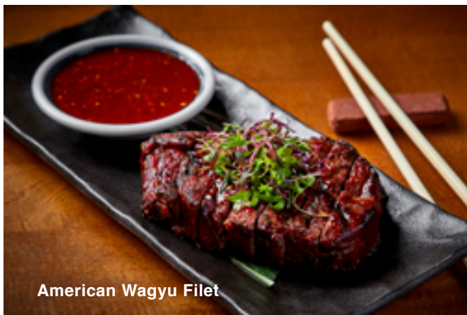
American Wagyu Filet