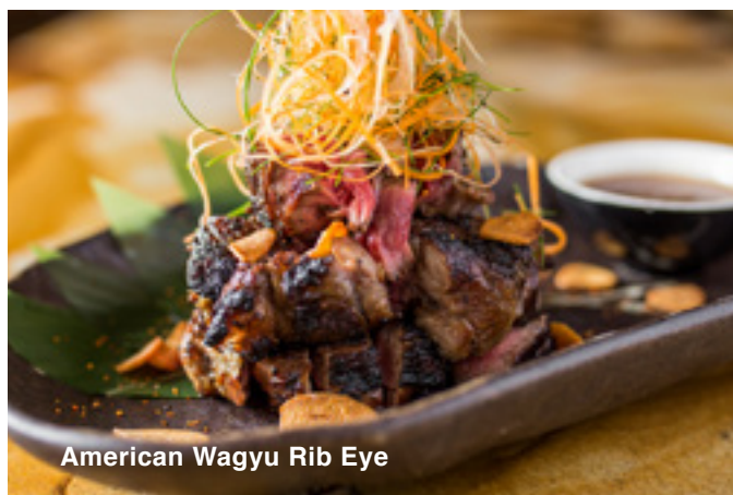
American Wagyu Rib Eye