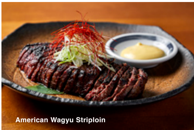
American Wagyu Striploin