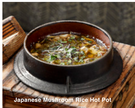
Japanese Mushroom Rice Hot Pot

Menu is served family style. Vegetarian, Vegan, and Gluten Free menus available upon request. Items subject to change based on seasonal availability.