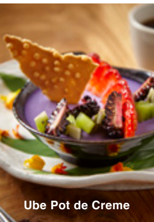
Ube Pot de Creme

Warm Valrhona Chocolate Cake with Vanilla Bean Ice Cream Ube Pot de Creme with Fresh Exotic Fruit and Bubu Tuile