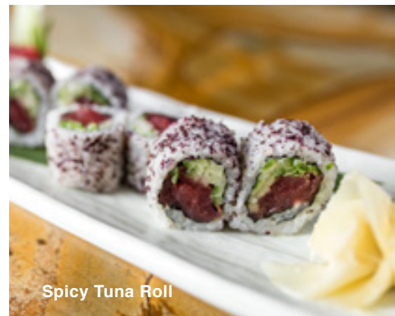
Spicy Tuna Roll