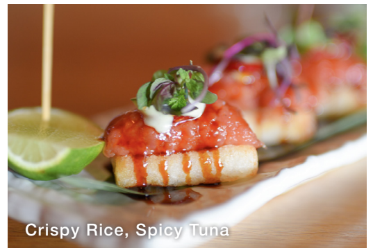
Crispy Rice, Spicy Tuna