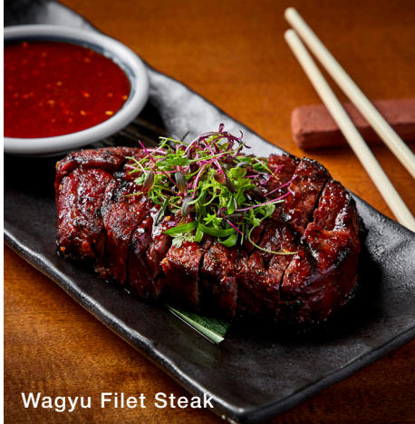
Wagyu Filet Steak